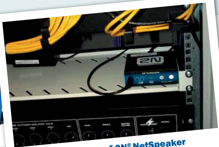
Installation of 2N® NetSpeaker

The 2N® NetSpeaker is an IP audio system that enables acoustic communication or other audio streams to be played from a given PC in a LAN/WAN network. For audio transmission over IP, all you need to do is connect a standard speaker or amplifier to the 2N® NetSpeaker, thus creating a virtual central broadcasting system. This allows for any audio to be played with the options to create separate zones with different communication content.